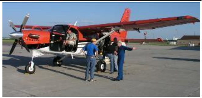
Right: "Kodiak" aircraft is a 10 seat turbo-prop plane that is the centerpiece of the STC program