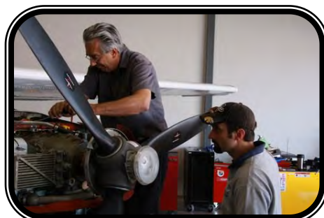
Fellow instructors working on an aircraft at Moody Aviation.

then, in a few years, of going overseas. I experienced God's generosity poured out through the generosity of not only friends and family, but also from people I had just met! I experienced the body of Christ coming together to pray and support me while trusting God to use my life. And besides that, I was able to visit my family and my home. It was a great trip!