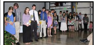
Graduates and wives praying during commissioning service

The Cessna T210 mentioned in our last newsletter has made one long trip from Spokane to Phoenix and is currently in the hangar having the last of its maintenance discrepancies repaired. The students have been learning much concerning retractable landing gear repairs and maintenance on a "new to Moody" airplane.