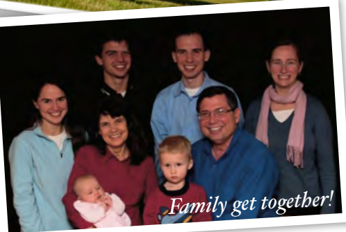
Family get together!

AFRICA INLAND MISSION ATTN.: RECEIPTING DEPARTMENT P.O. BOX 3611 PEACHTREE CITY, GA 30269-7611