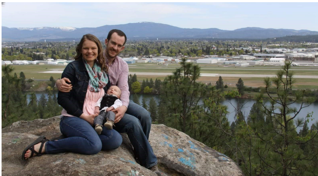
Felts Field — Home to Moody Aviation

Dear Friends and Family, An update letter is far overdue! The days, weeks, months, and years seem to be passing at an accelerated pace. We have lots to share!