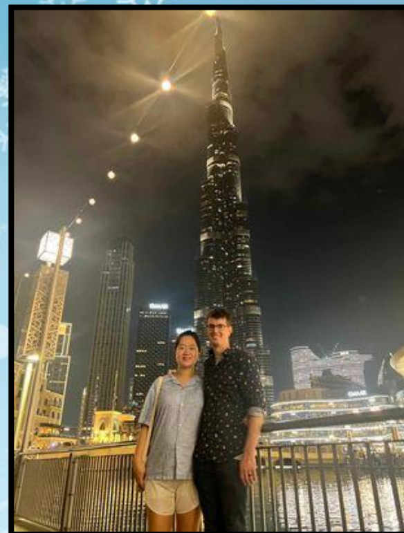
Standing in front of the Burj Khalifa in Dubai, the tallest building in the world.