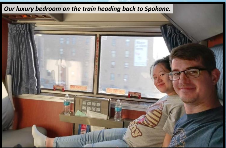
Our luxury bedroom on the train heading back to Spokane.