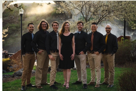
Moody Aviation Class of 2023