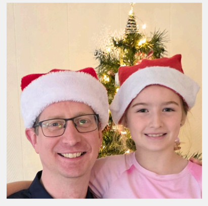
Gwyn and I getting ready for Christmas. She is growing up so quickly!