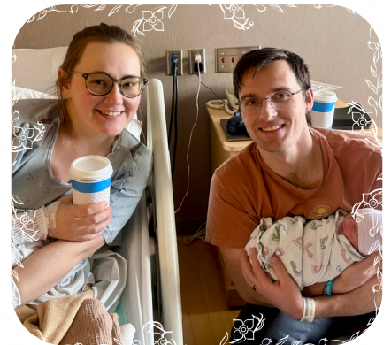
Our new family of three - The morning after August was born