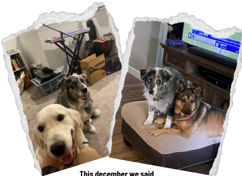
This december we said goodbye to our beloved Brandy after recent aggression toward family. To help in grieving and give Fenway another friend, we adopted sweet a 3 year-old, Golden, "Sandy".