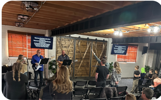
Meeting as a small church before merger