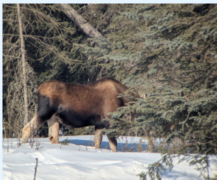
Front yard view