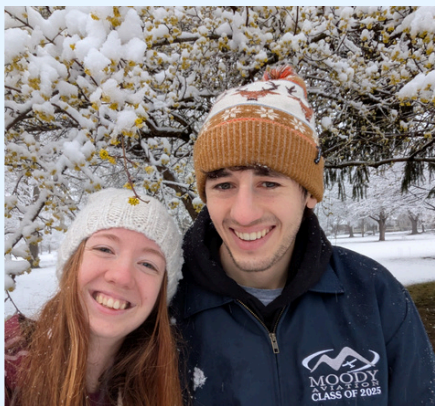
Late spring snowfall in WA