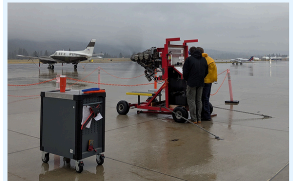
Students working on an engine

Because this role is a fundraised position through Proclaim Aviation, we have begun support raising in order to serve at Moody for the next two years!