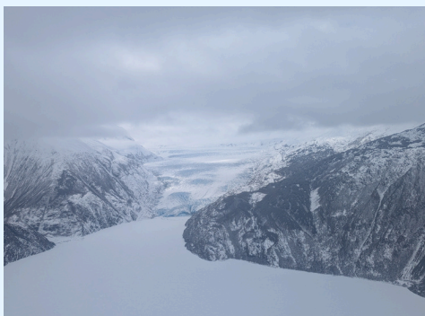
Flying by a glacier