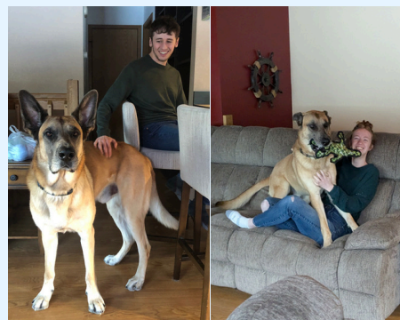
Visiting friends (and dogs!)