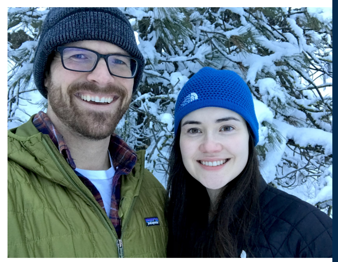
Enjoying the last few days of winter, but looking forward to spring!