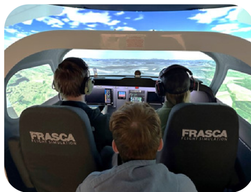
Flight Training in the new Frasca Flight Simulators