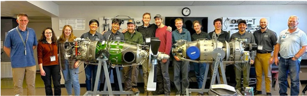
Students at the Turbine Engine Seminar at JAARS/Wycliffe in North Carolina

Here in Spokane private pilot training has begun with students using the three new Frasca flight simulators. These are the latest edition, and allow some simulator time to count as actual flight time. Moody was more than grateful to be the first flight school to receive these simulators.