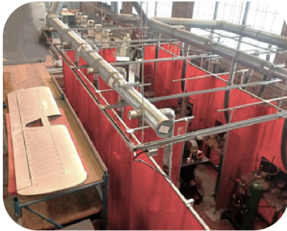
The new welding shop with the "astonishingly beautiful red translucent welding curtains"