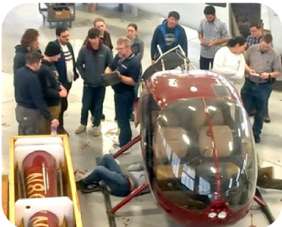
Robinson R44 Helicopter Maintenance Instruction