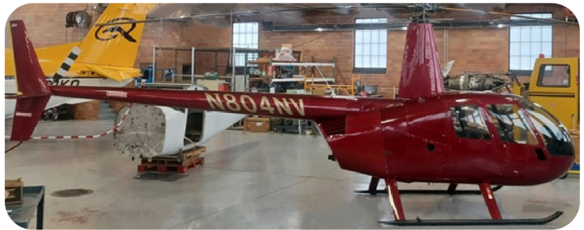
Robinson R44 Helicopter for Maintenance Instruction.